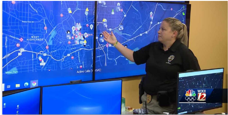
RTCC ShotSpotter demonstration

Such efforts may allow officers to respond quickly, or even immediately, to crimes in progress or to those that recently occurred. Technologies available will allow officers to respond to crime events more efficiently, more deliberately, with improved operational intelligence, and with a proactive emphasis on officer, citizen, and community safety.